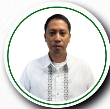
Officer-in-Charge, Administrative and General Services Department/Appraisal and Credit Investigation Department