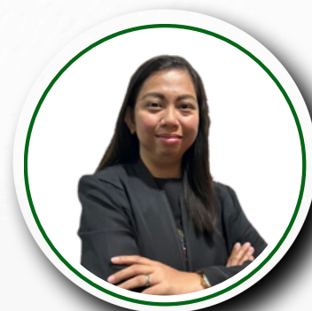
Officer-in-Charge, Finance Department