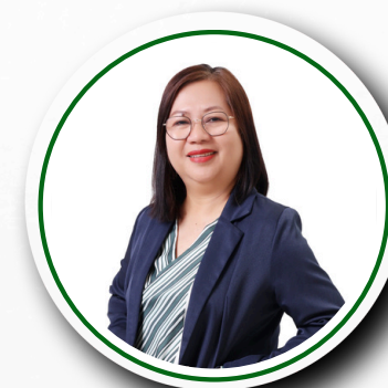
Administrator, Ecozone Management Department