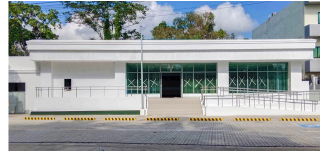
LBP ALABANG BUSINESS CENTER