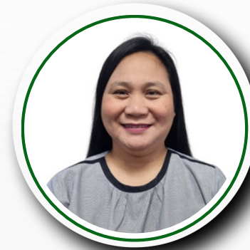
Officer-in-Charge, Property Management and Maintenance Services Department