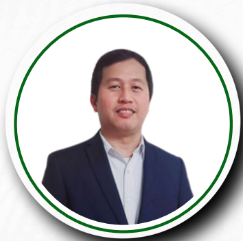
Officer-in-Charge, Construction Management Department