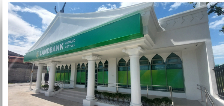
LBP COTABATO CITYHALL