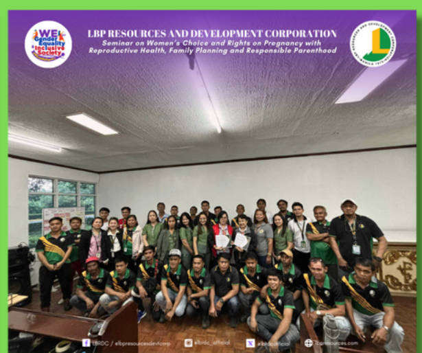
LBRDC Gender and Development Seminars and Activities