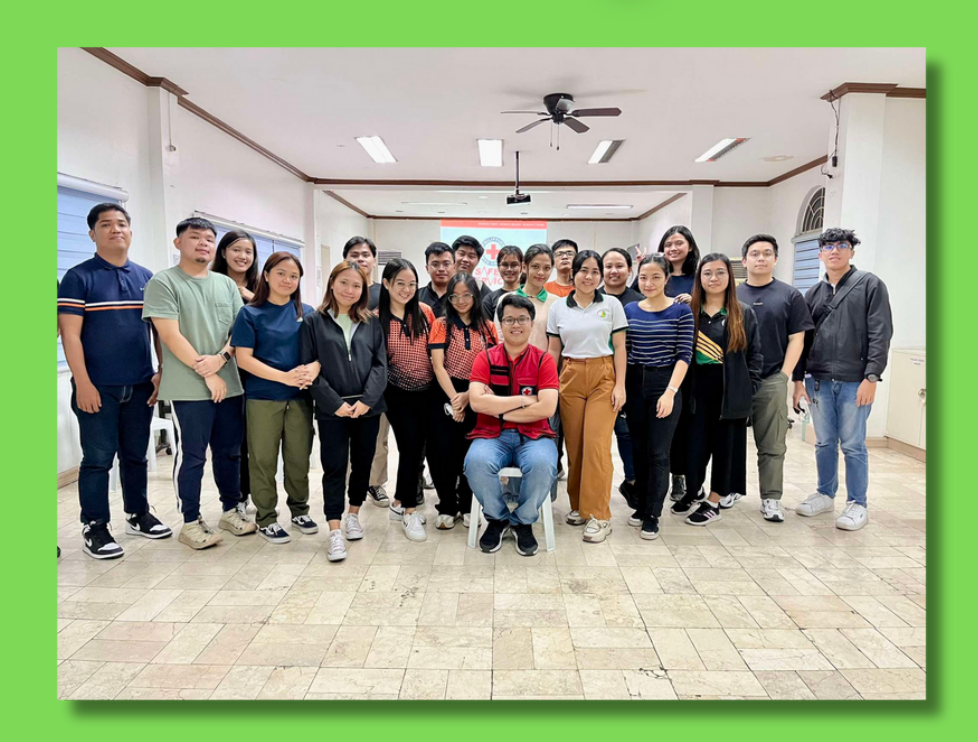
LBRDC Employees attended Response Skill training: First Aid at philippine Red Cross - Manila Chapter Instramuros Manila