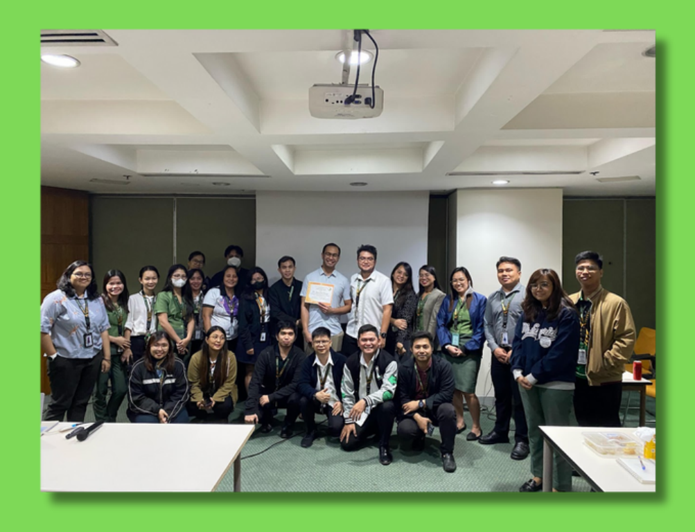
Community Psychological Support Seminar