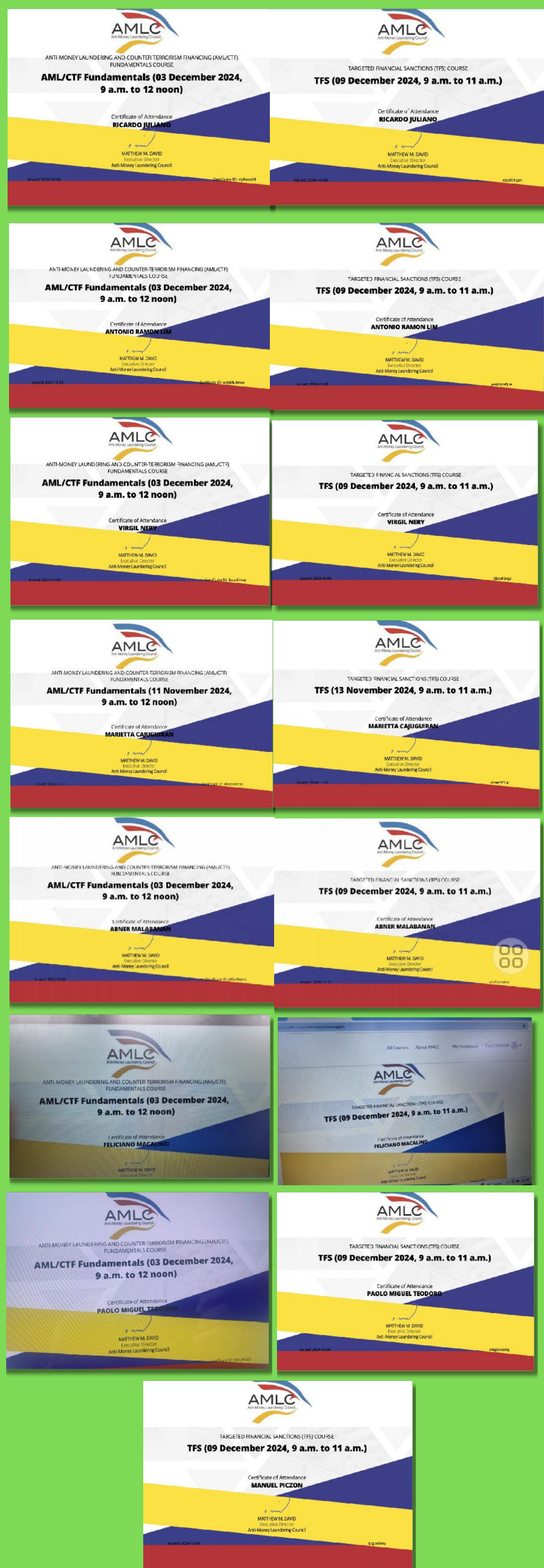
LBRDC BOARD OF DIRECTORS SEMINARS CERTIFICATES