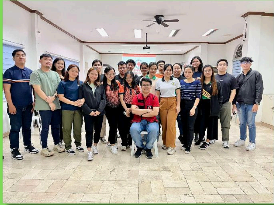
LBRDC Employees attended Response Skill training : First Aid at philippine Red Cross - Manila Chapter Instramueros Manila