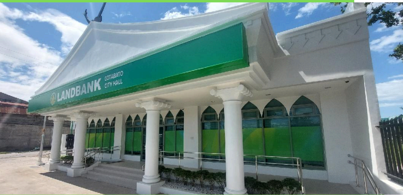
LBP COTABATO CITYHALL