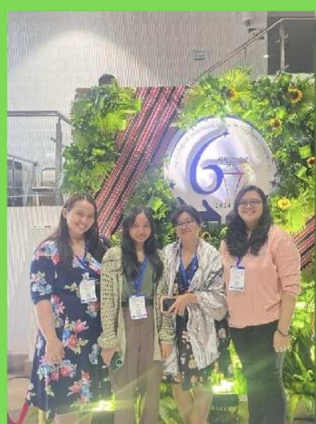
Personnel Unit attended the 60th Psychological Association of the Philippines (PAP) Convention, held at the Baguio Convention Center from September 26-28, 2024.