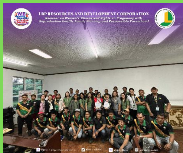
LBRDC National Womens Month Seminars and Activities