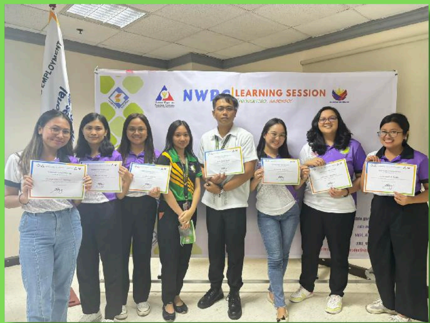
Administrative and General Services and Personnel Unit attended National Wages and Productivity Commission learning session