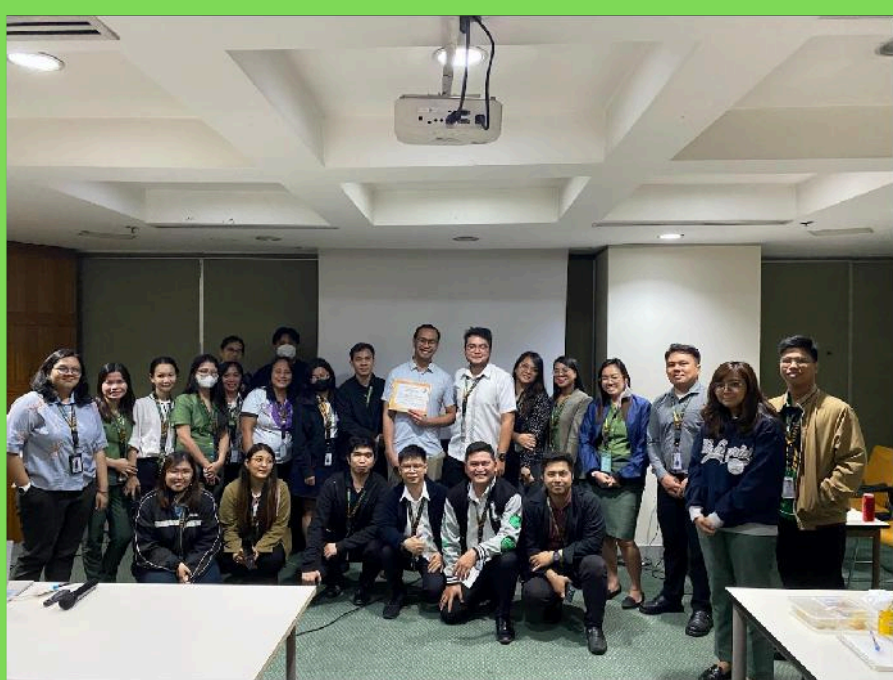
Community Psychological Support Seminar