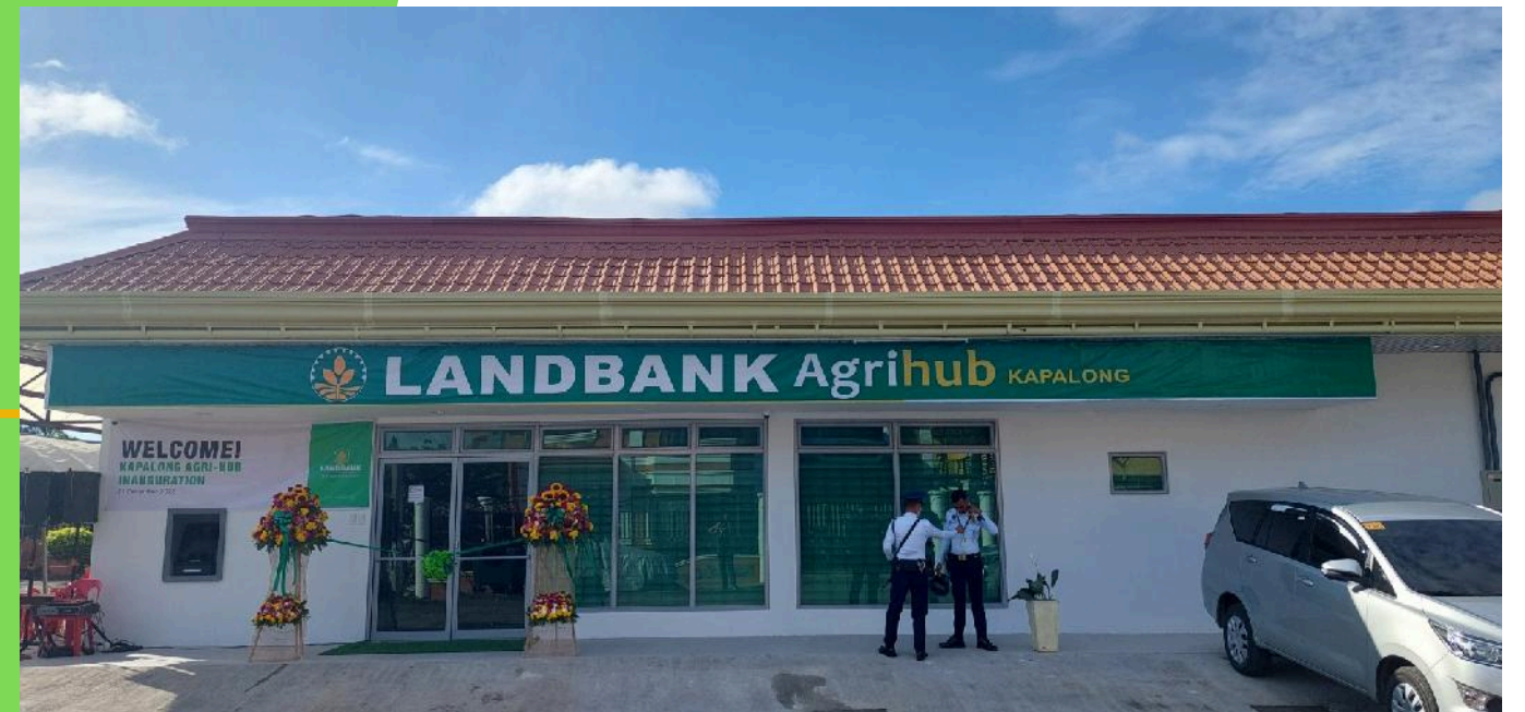
LBP KAPALONG AGRIHUB BRANCH